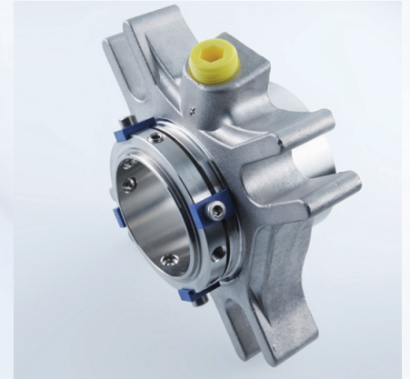
Universal applicable for packings conversions, for retrofits or original equipment: Cartex single seal

Some years ago, the customer and EagleBurgmann signed a "TotalSealCare" contract and started to convert all pumps from component seals to "Cartex" seals, i.e. cartridge single and doubles seals. Principally Cartex single seals are installed on the pump shafts to prevent egress of the process fluids. These mechanical seals are completely pre-assembled and precisely positioned component seals with cover plate and shaft sleeve. The cartridge design allows for quick and