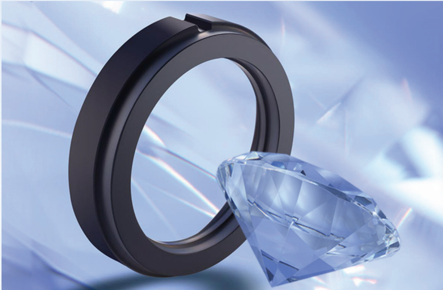
DiamondFace is a synthetically-produced pure diamond with the same excellent properties as natural diamond ...

One of the next steps was to optimize the Cartex seals by using DiamondFace technology: A special procedure provides the surfaces of the seal faces with a microcrystalline coating of artificially produced diamond, making them extremely wear-resistant and capable of partial dry running. Furthermore, very little heat is generated during the dry running phases.